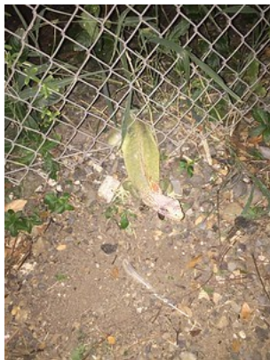
Left: Distressed Iguana