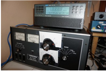
Left: Old vs New Technology SPE Amp vs AL1200 Amp