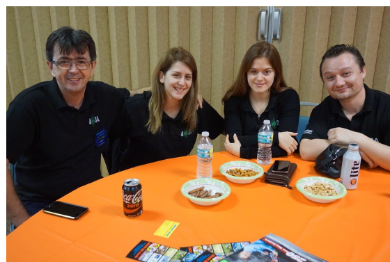
Above The 403A Contingent