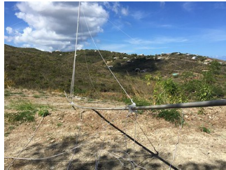
Right: Downed 160M Pole at KP2J