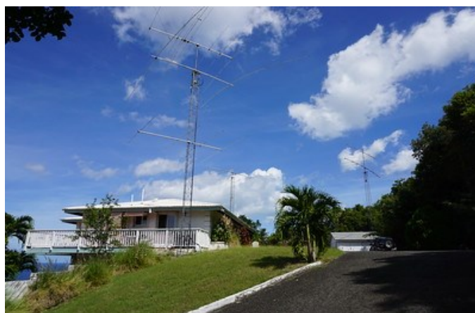
KP2M Radio Reef QTH