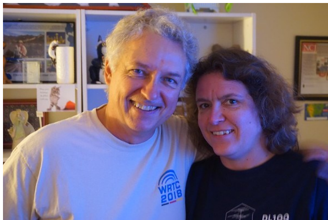
Florida Contest Group meets Bavianian Contest Club