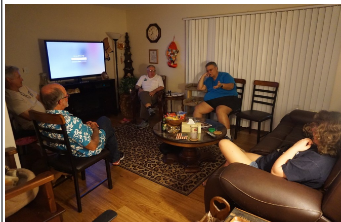
Lu W4LT explains the technical details of the remote installation to the assembled guests.