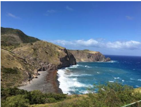
The beautiful shoreline at Little Bay