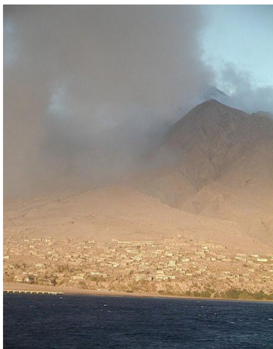
Left: A photo of the actual eruption of the volcano that destroyed Plymouth as it was happening in July 1995.