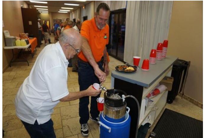
Two attendees sample N4GI's 8877 Amber Ale