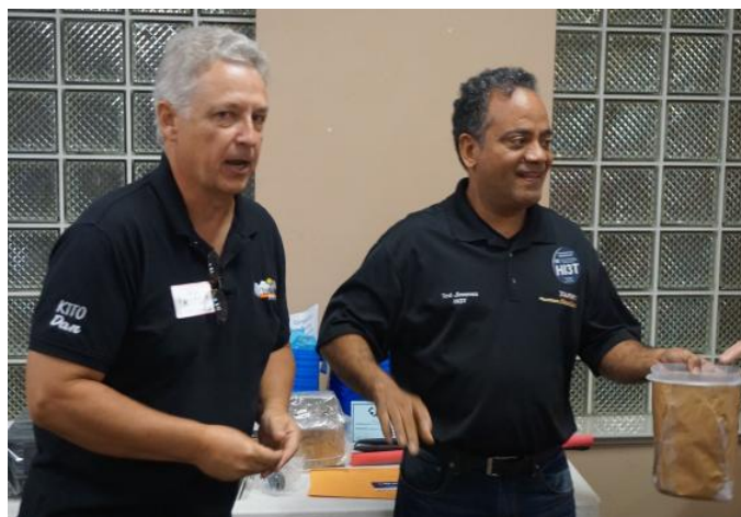
Who will win the Grand Prize? Waiting.....Waiting.....