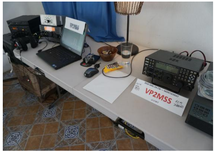
ARRL DX CW Contest Station