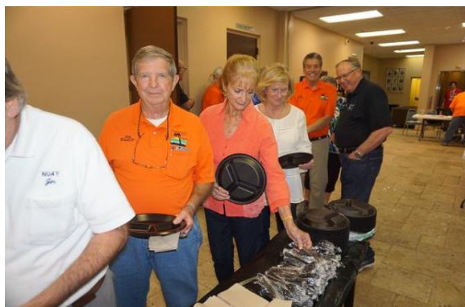
Chow Line in action !