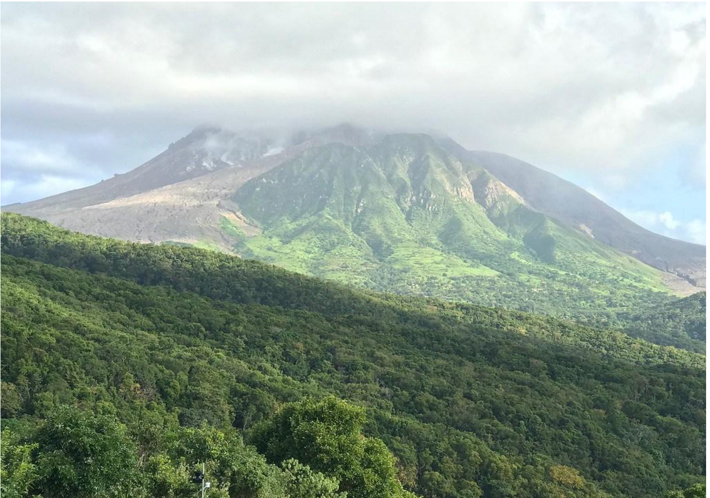
The Soufriere Hills Volcano as it looks today