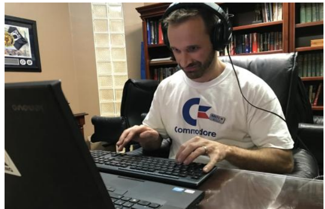
Above: Wolf NN7CW