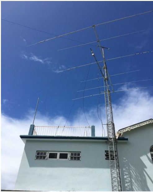
The 60 ft tower and TH-6 at the Gingerbread Hill house.