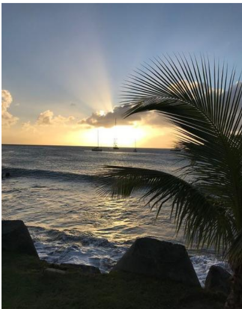
Sunset over VP2M