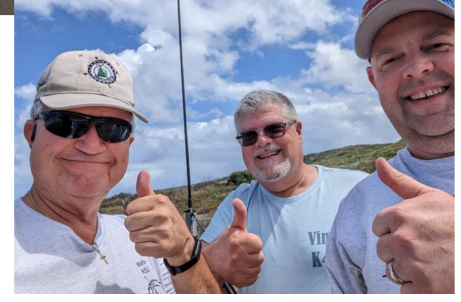
Successful activation on Day 1!