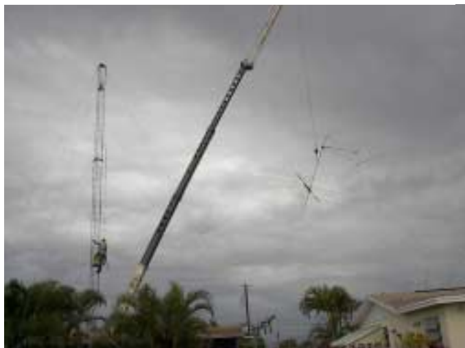
Coming down !