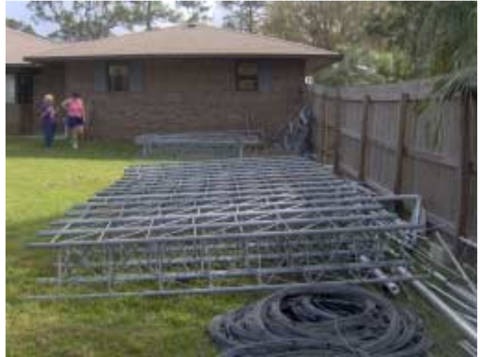
Here are pictures after the unload. 340 feet of Rohn 55G with plenty of accessories

Multiple 80 / 75M slopers as possible. See note at right.