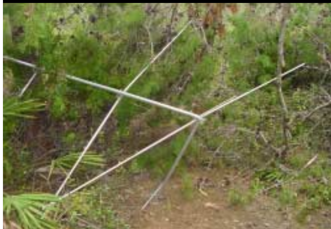
Post Hurricane Jeanne 5 elements on a 12 ft Boom - In the Woods