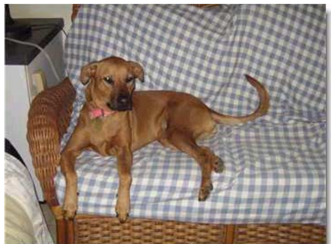
Valentine - Boy, I'm glad that's over...what a racket! And they complain about my barking...Hah!...I mean Woof! Finally I can have my bed back. Next time you guys better show up with a bone. Adios Amigos!