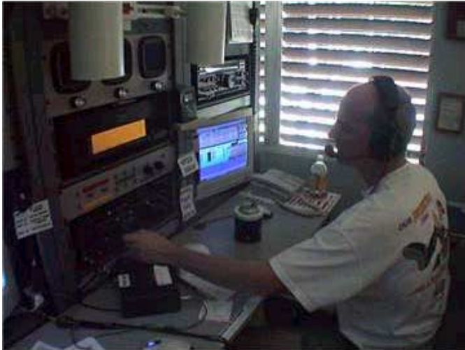
Fred _ Hola Contesto! We take points in any language. Mon!