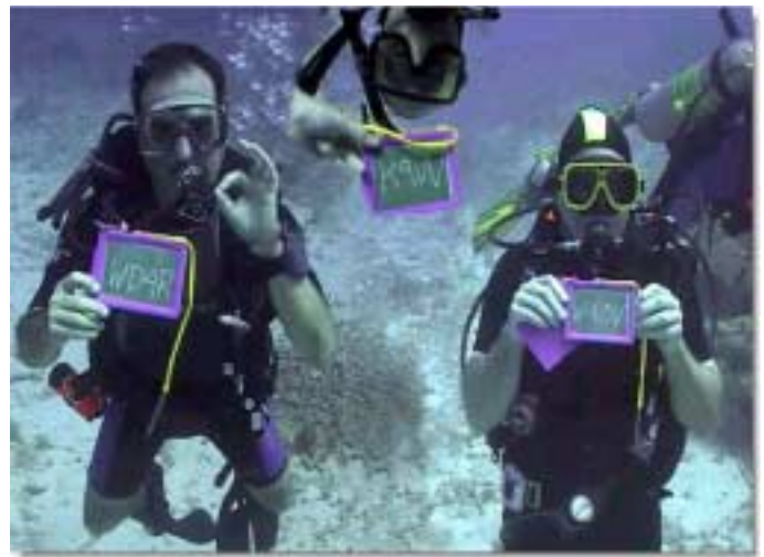
The team takes to the water!