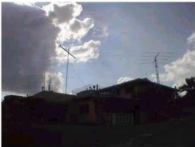
The NP2B Antenna Farm KT-34 Triband Beam, Log Periodic Beam, 2 Element 40 Meter Beam, Dipoles for 80 and 40 Meters