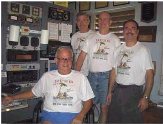
The NP2B Contest Team