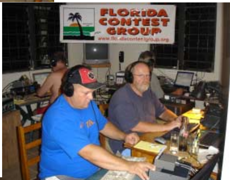
L-R, W4IX, K1XX, KK9K