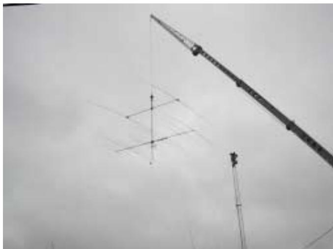
Repaired antennas being craned for insertion