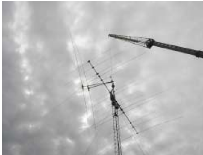
Removing bent mast and folded up XM-240

- 13 clubs had entries Contest Club Ontario South East Contest Club Florida Contest Group Society of Midwest Contesters Yankee Clipper Contest Club Tennessee Contest Group Frankfort Radio Club Mad River Radio Club Western Washington DX Club PVRC Grand Mesa Contesters MN Wireless Association Willamette Valley DX Club