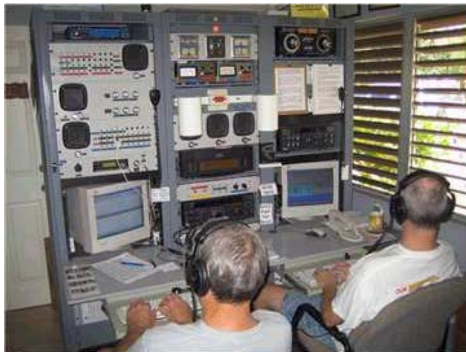
The Main Operating Position at NP2B Bruce W4OV at Left, Fred K9VV at Right