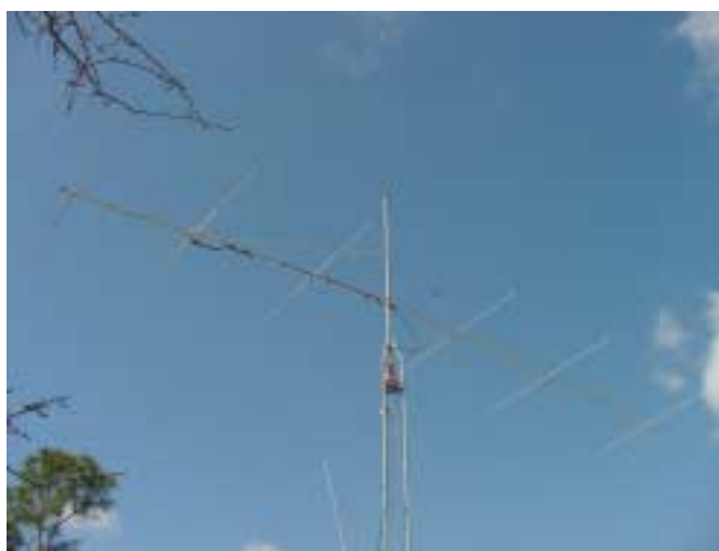
After rebuilding Cushcraft 617-6B 6 Meter Boomer 6 elements on a 34 Ft Boom