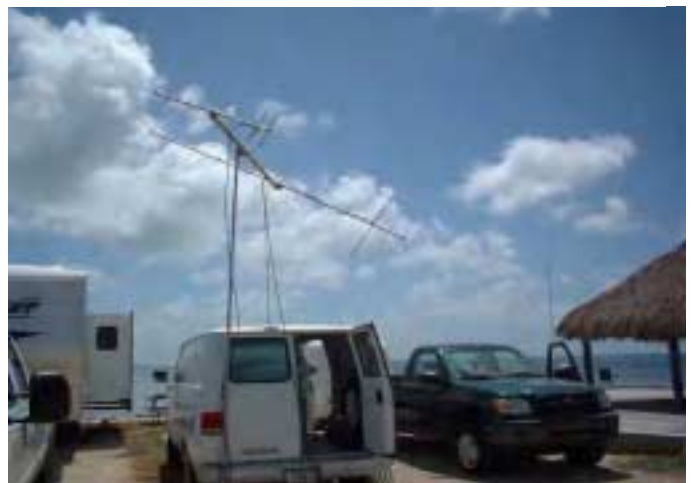
Packet and Satellite Station in the N4GM Van