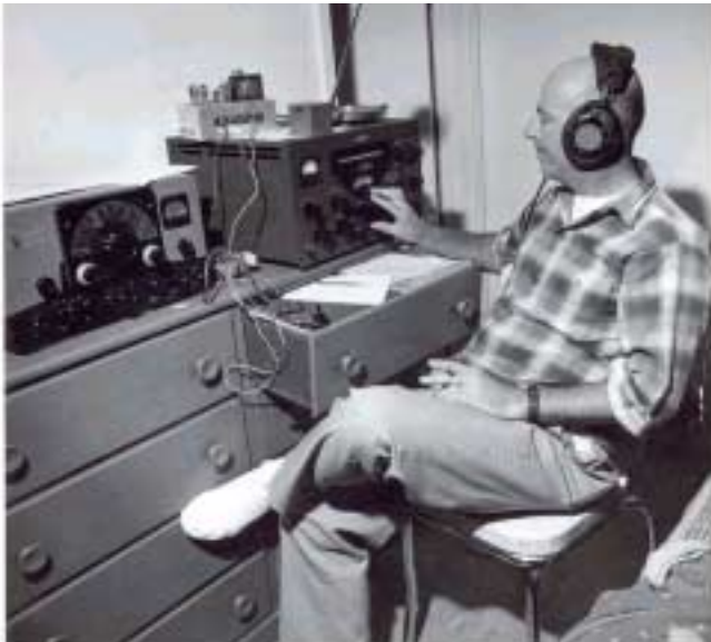
Above - Ink N400 operating at the W4QBK QTH in Clearwater late in the 1970s