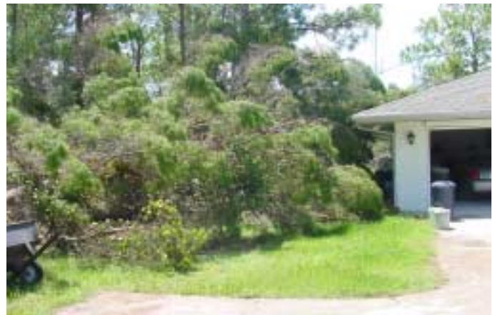
Buried in there somewhere is N4TO's bent but not broken 80 Meter 4-Square - Sebring

Ed. Note: Reviewing reports on the reflector, it appears that no FCGers have reported any physical injuries from the storm but that several folks had fairly extensive antenna damage.