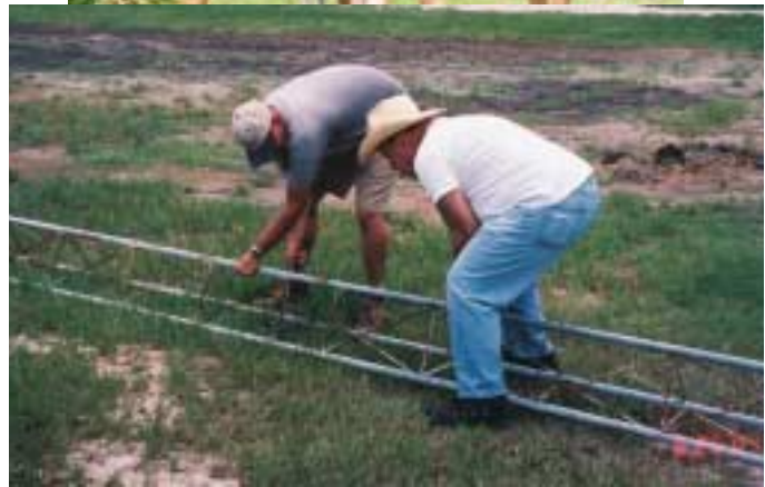
The above four pictures are from the setup/takedown activities at the NJ4M Field Day site at Twin Lakes Park in Sarasota.