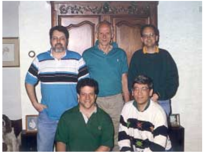
Same group as at the left in a 1992 reunion, standing l-r KIEA, WIZA, KCIF, (an add on for the reunion) Sitting, l-r KIIR, KIVR