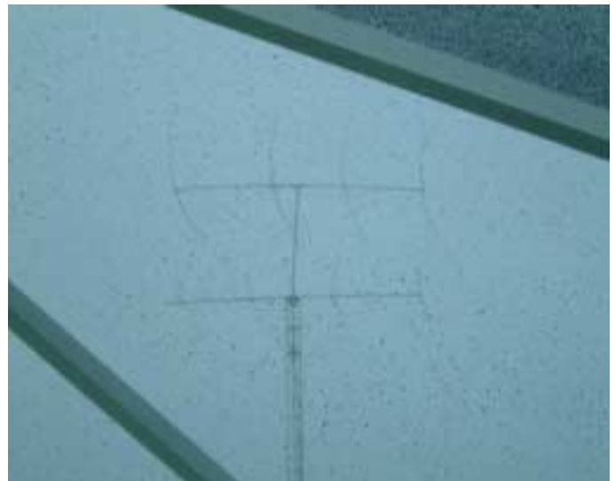
Top 20 and 15 really blowing KITO - Myakka City