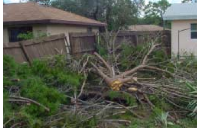
W4/G4BUE Backyard - Sebring