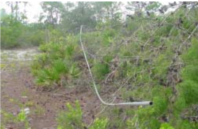
K4LQ 80 Meter (ex) Vertical - Lake Placid