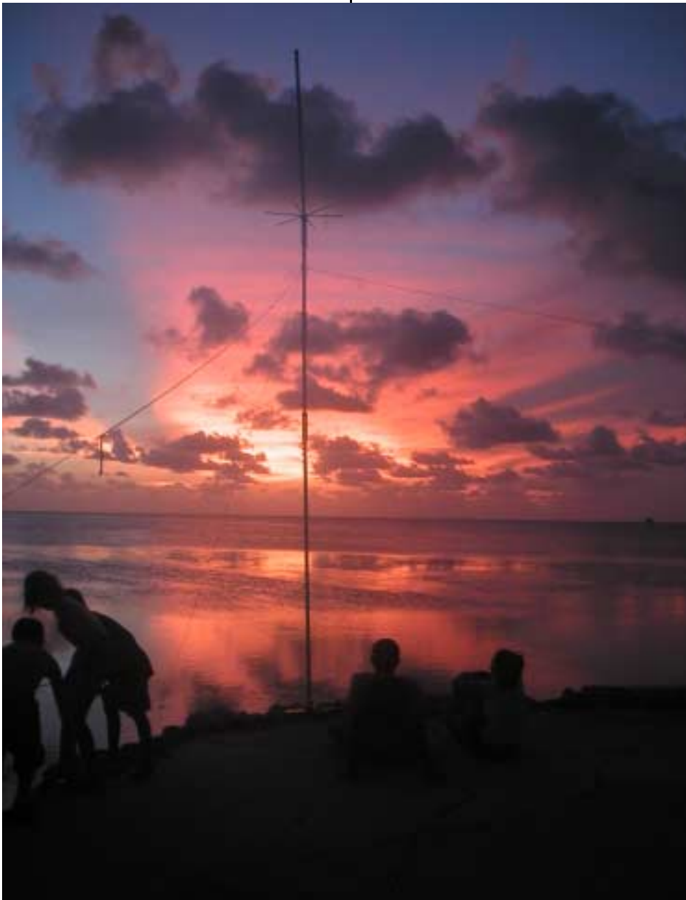
Sunset on the 4BTV