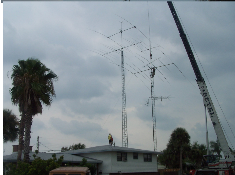
Top: Jeff and Tim on the Trylon 80 foot tower finalizing the Force-12 C31XR after putting up the XM240