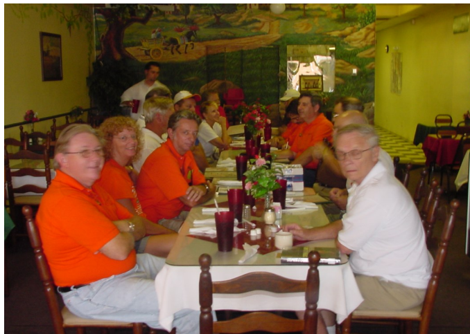
Enjoying lunch at Franco's - Left from Foreground - K5KG, KD4BRJ, N4EK, 2 people obscured, K1PT (with the hat) KD1BG. Right from foreground W4YA, 2 people obscured, K4DDR, NA4CW.