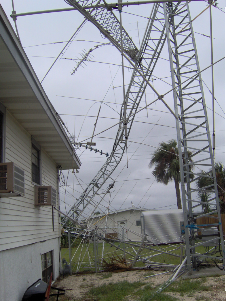
More Views of K9ES Post Wilma