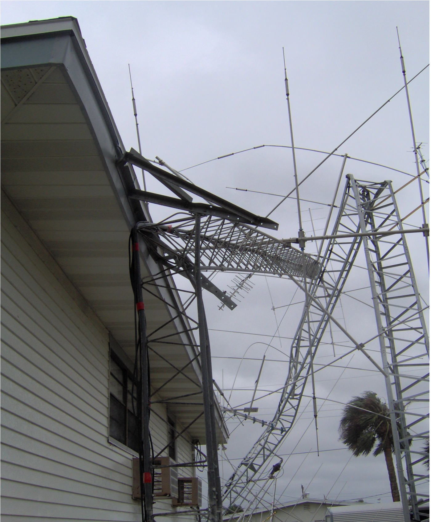
K9ES After Wilma