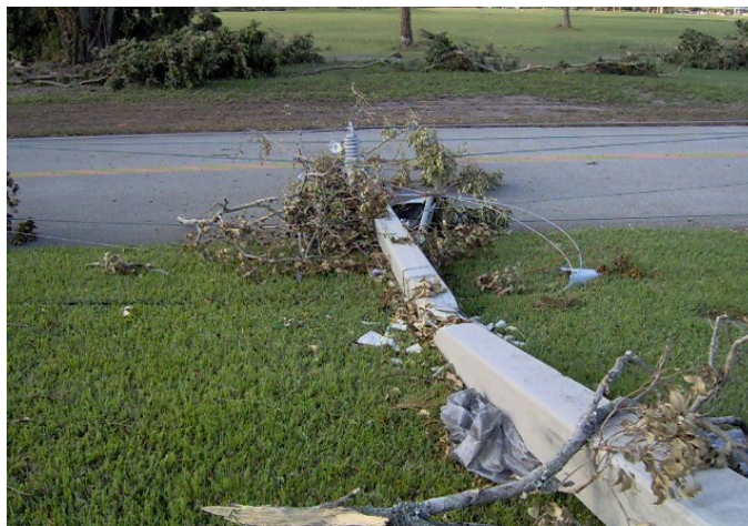
12X12 Concrete Power Pole near W4OV Up since 1967