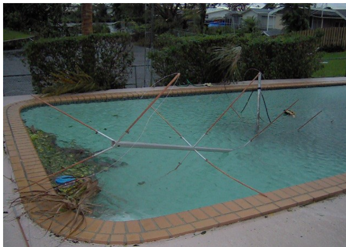
W4OV 6M Quad Takes a Swim