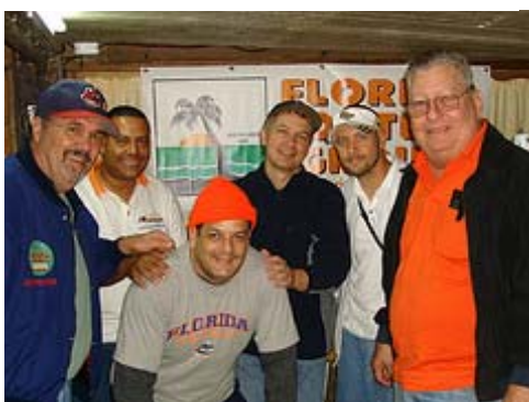
K8NZ, AD4Z, Host HI3CCP, K1TO, N4GI and N4TO after the contest.