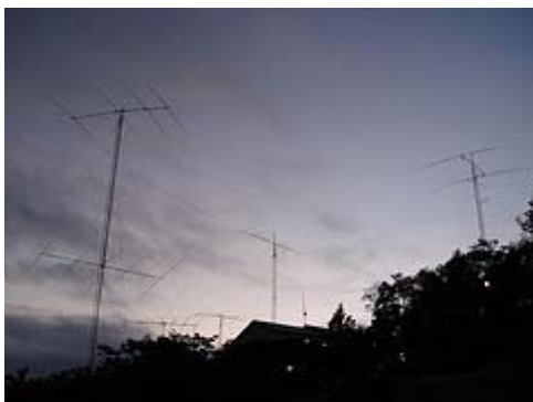
HI3A Antenna Farm