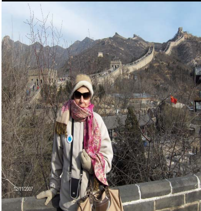
Ellen decided it wasn't practical to run an antenna up the Great Wall, she was too busy keeping warm ;<)