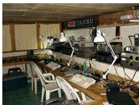
The HI3A Operating Position for M-2