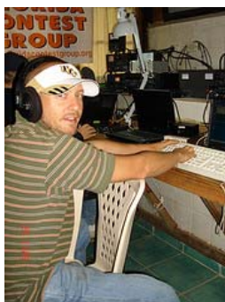
Left: Blake N4GI was cool under fire all weekend.