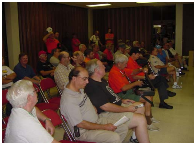
Above Left and Right - Attendees at the Contest Forum