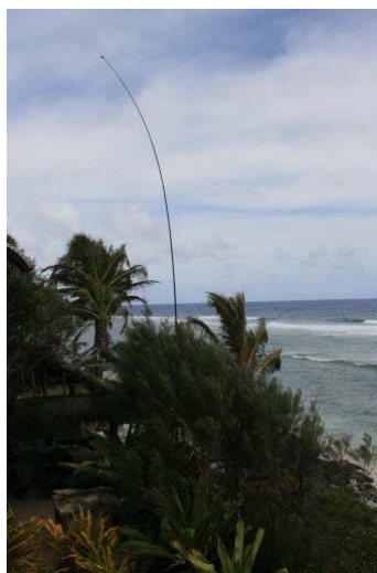
160m inverted L on 60 ft. fiberglass mast.