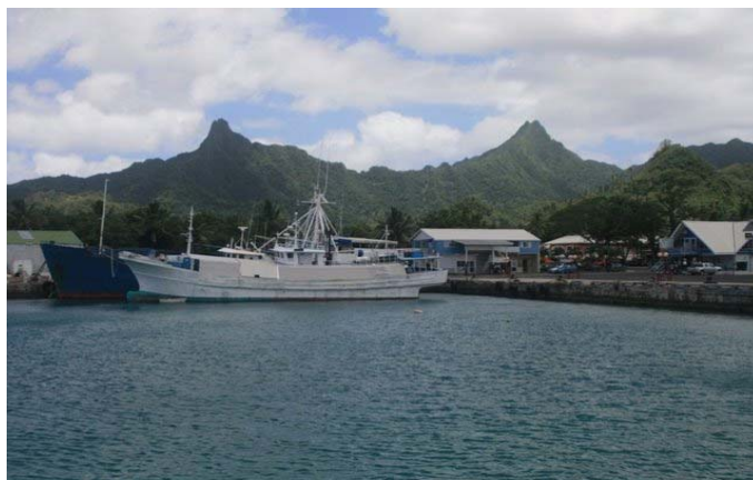
Rarotonga Harbor. The volcanic landscape is visible in the background. It is a 32 km drive around the island.