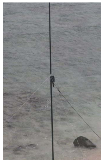
15 Meter dipole on an MFJ Mast using a Foster's beer bottle as a balun coil form