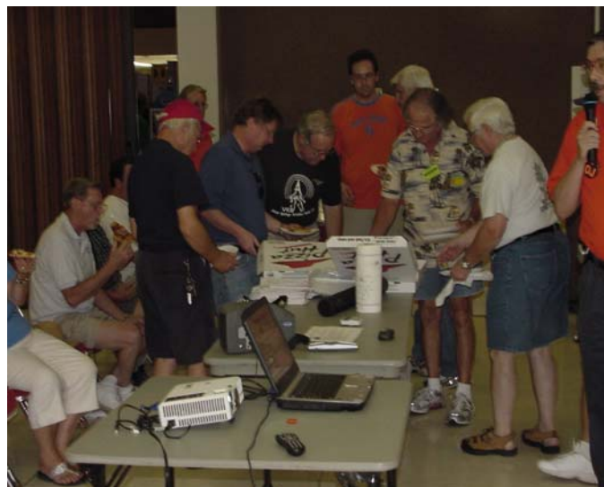
Pizza proved very popular among Forum Attendees