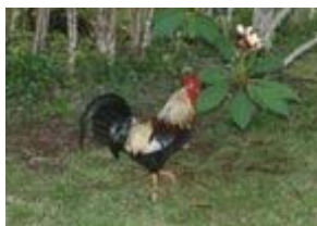
Left: Gray Line our alarm cock!