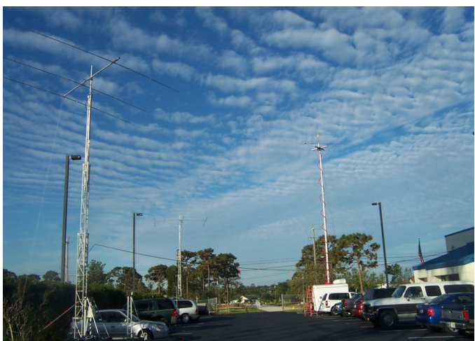
15 Meter, 10 Meter and VHF Antennas