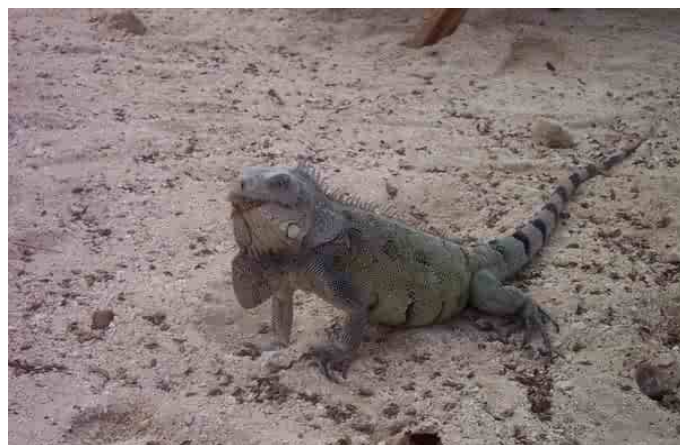
A very friendly creature