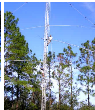
Removing broken 20M beams from tower