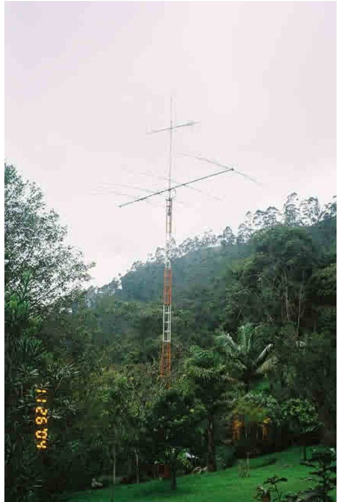
Completed Antenna Installation - 5K5Z