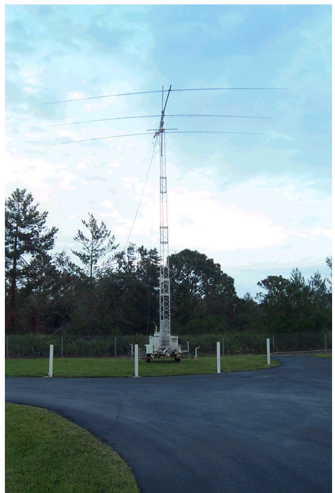
3 El 20M Yagi

The operation produced 3 times as many QSOs as ever made from WX4MLB during a Skywarn Recognition Day. We believe that the operation may have placed NWS Melbourne at the top of all NWS Stations. Hope some of you had a chance to work us. QSL via QRZ.COM info.