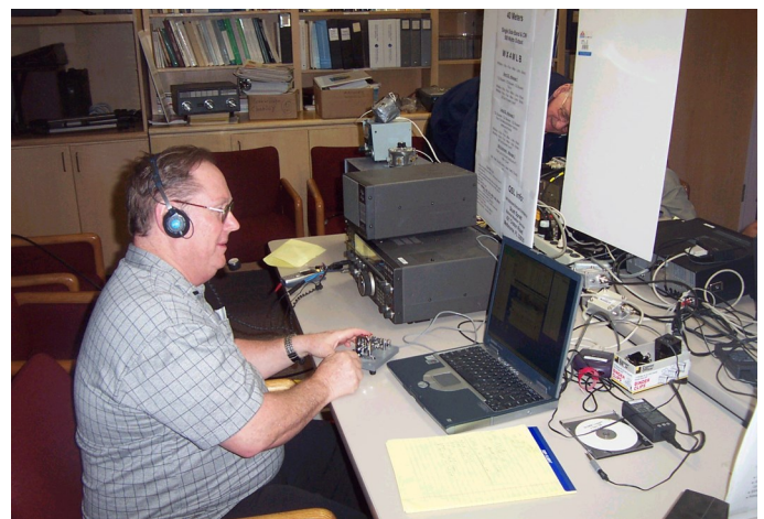
AD4ES on 40M SSB