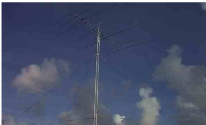
Force 12 C31XR at 60 Feet