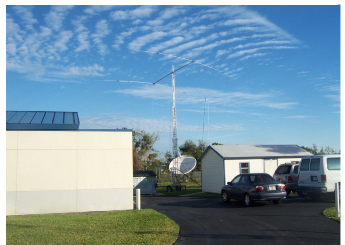
40 Meter Beam