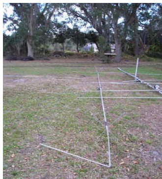
Broken beams finally down