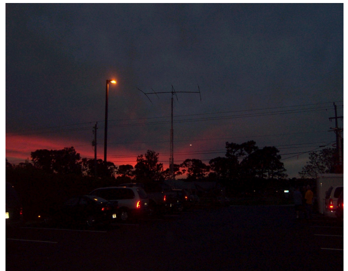
10 Meter Beam at Sunset