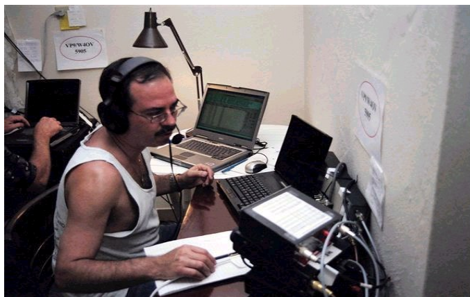
Julio WD4R in action during the Contest