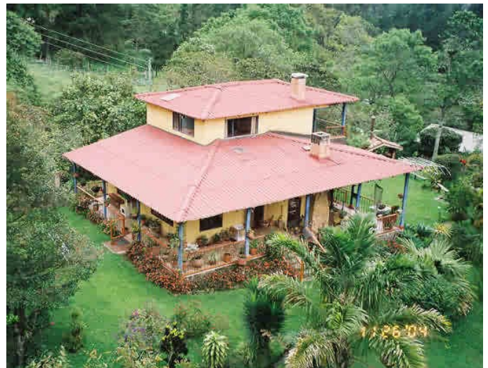
The 5K5Z QTH