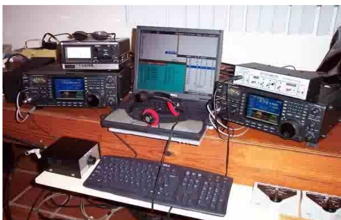
SO2R Setup at PJ4J