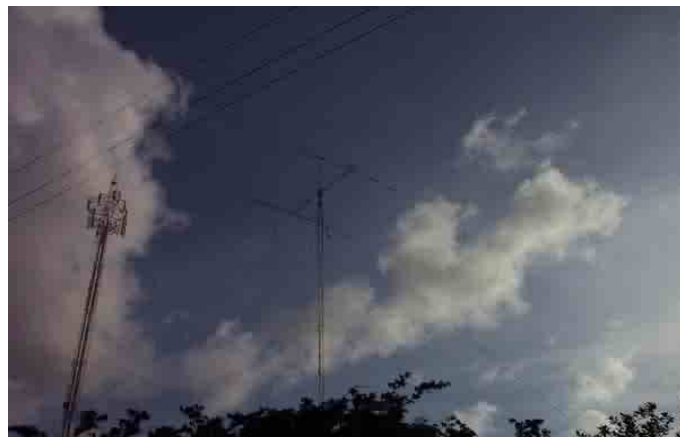
2 element 40 Meter beam at 90 Feet