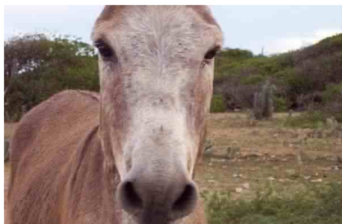
Closeup of another friendly fellow