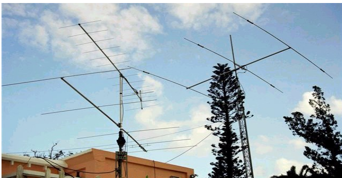
The Antenna Farm at VP9GE

Our station consisted of 2-ICOM 706s, 2 lap top computers running CT, A3 and A4 yagis, a G5RV and a dipole in MSLP 3840 X 408 111 4,767,015