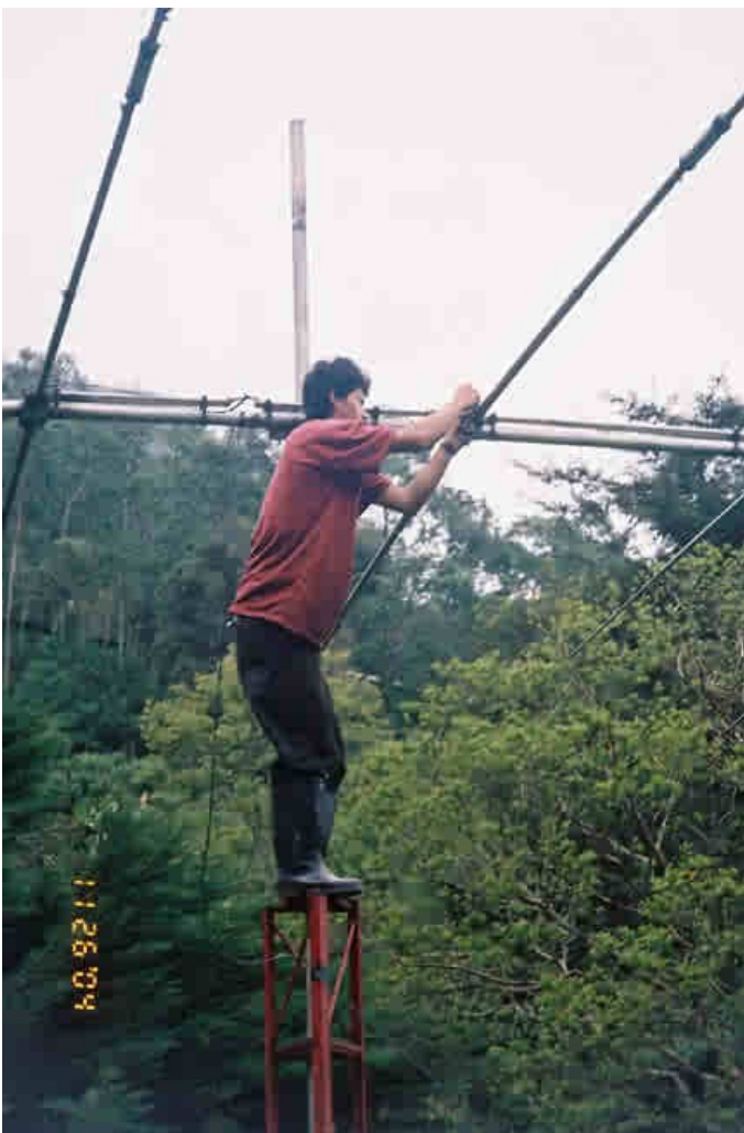
Final adjustments before the contest!