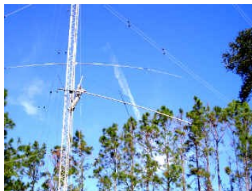
Removing 10 Meter beam with a broken boom.