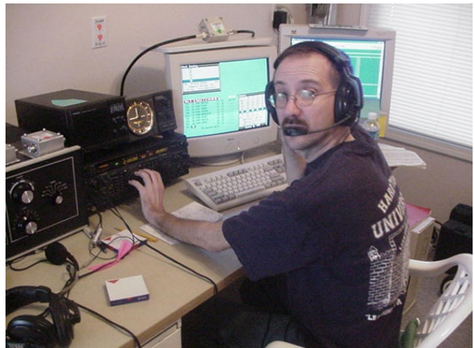
Above: N4OX at Mult Station