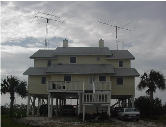
The N4PN QTH