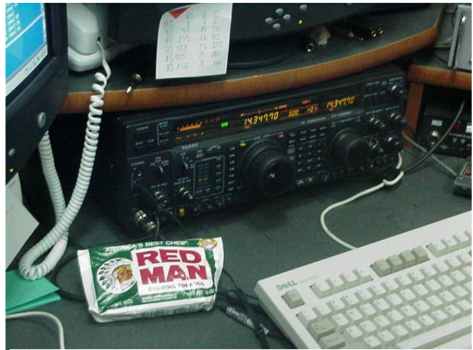
Red Man, the official Chewing Tobacco of the N4PN 2002 CQWW SSB Contest

Team Whoop Ass has openings for qualified operators (breathing and capable of speaking Southern)....apply to N4PN or NF4A for more details.