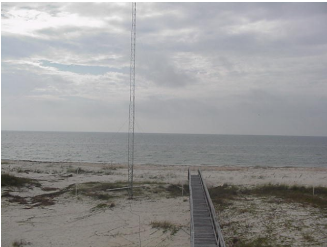
The N4PN 160 Vertical - Notice the distance to the Gulf