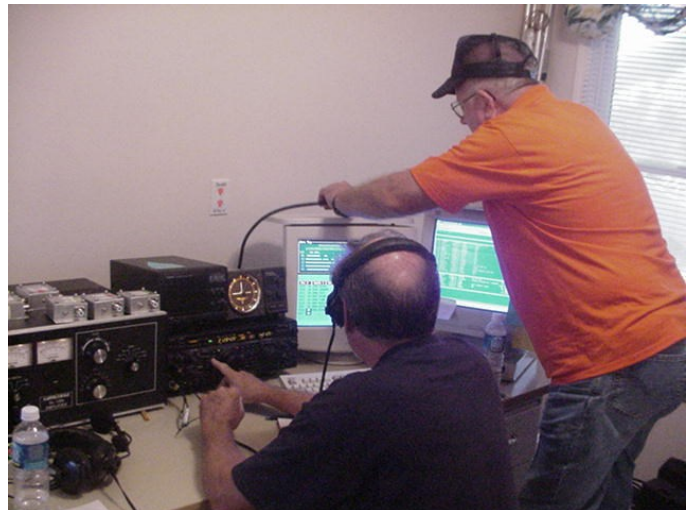
KB4ET assists N4PN at Mult Station