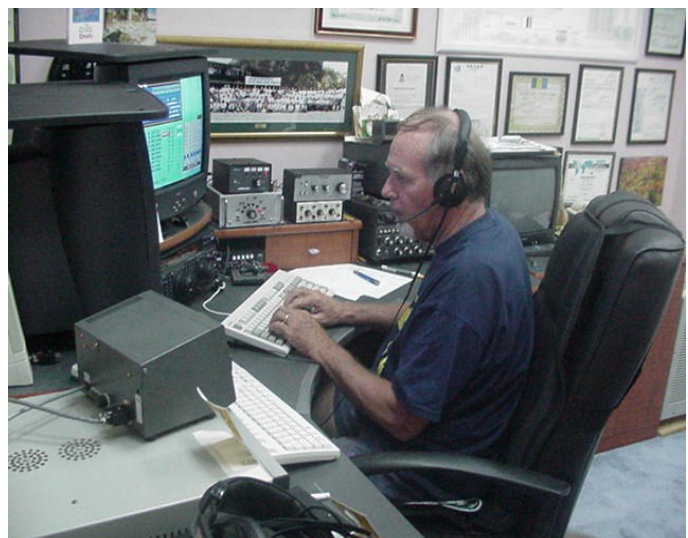
Below: N4PN Running