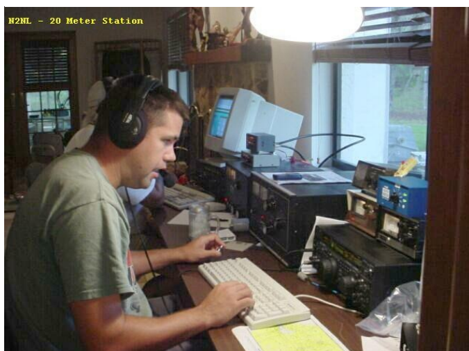
Below Vic N4TO