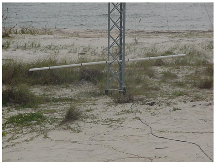
Linear Loading on the N4PN 160 Vertical