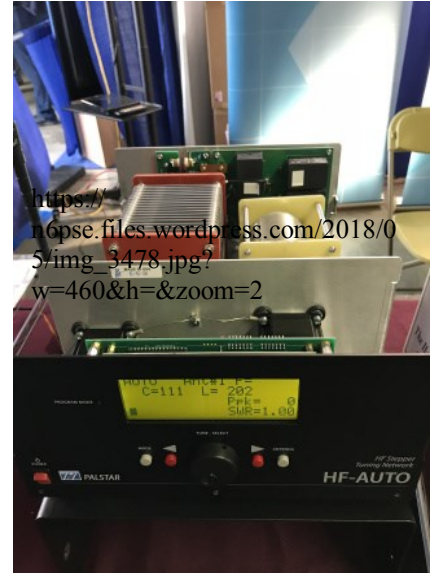
Palstar Antenna Tuner