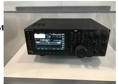
Flexradio 6400M Transceiver