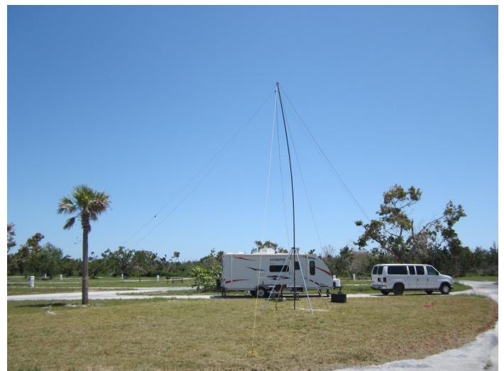
Homebrew antenna stand, fiberglass military masts around 35', G5RV jr. antenna in an inverted V configuration.