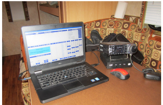
IC-7000, KDG IT-100 autotuner, Dell laptop with N3FJP software.