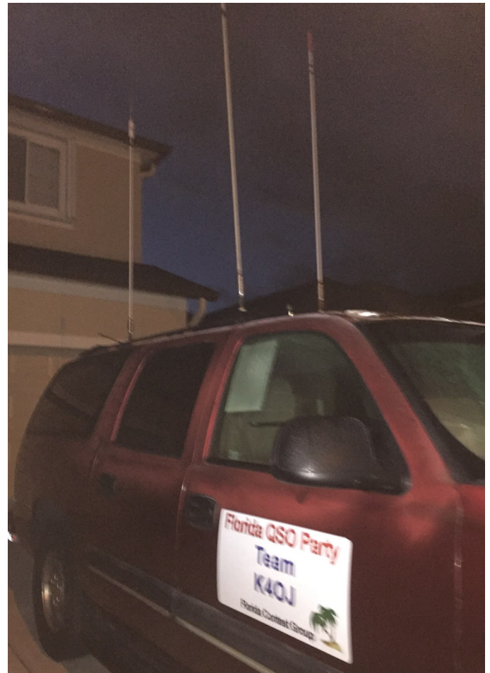
Above - K4OJ/M Antennas