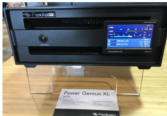
Flexradio Power Genius XL Solid State 1500 Watt Amplifier