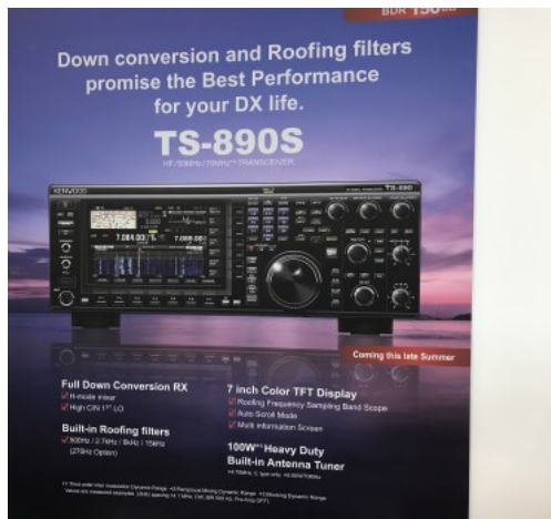
Kenwood TS-890S Transceiver