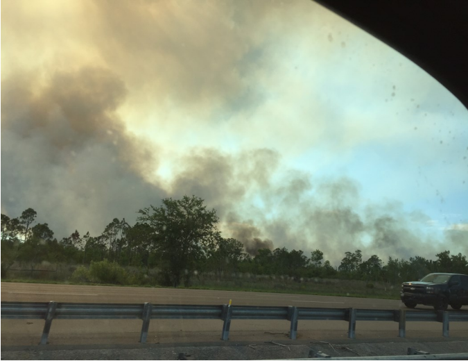
No stop here—a good sized brush fire