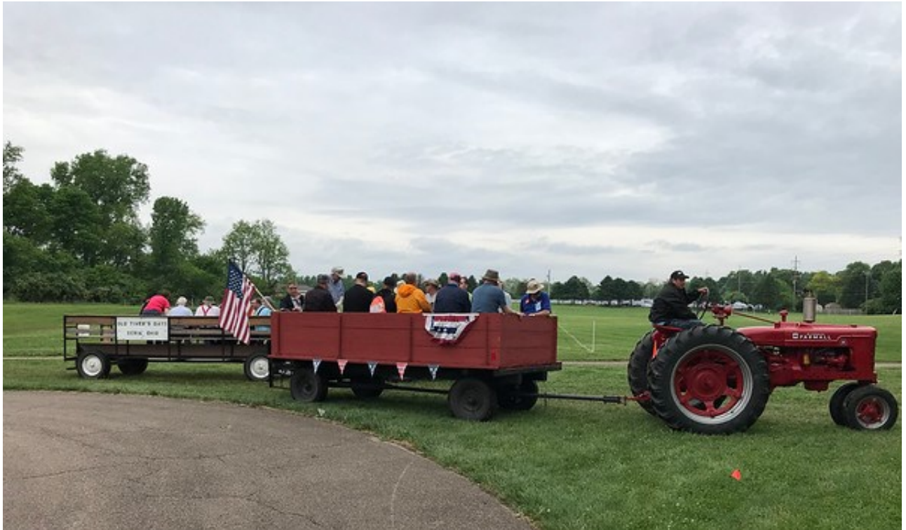
Above: Attendees were hauled from the parking lot to the main hamfest with tractors and trailers.