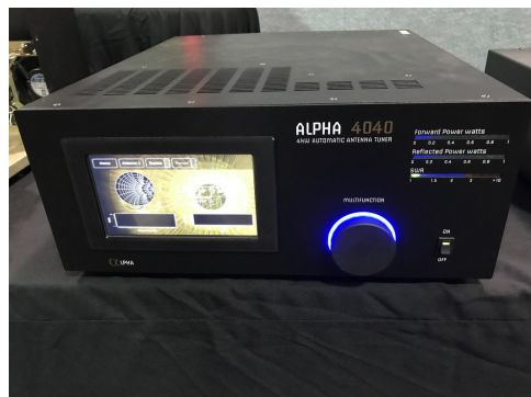
Alpha 4040 4KW Automatic Antenna Tuner