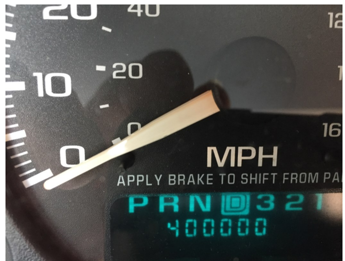
Better get to the gas station - Pronto!