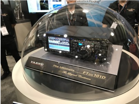
Yaesu FT DX 101D