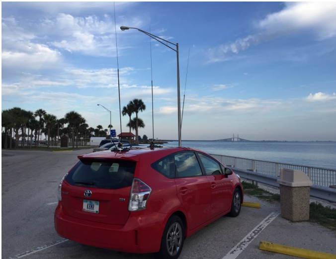
Above and Below: At Fishing Pier State Park