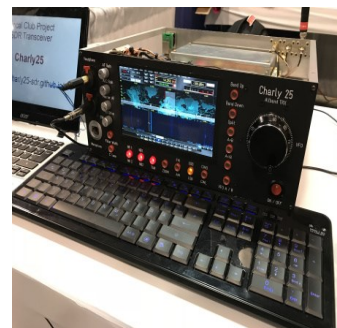
Charly 25 SDR Transceiver