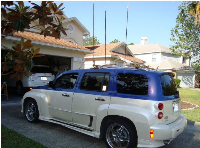
All the pictures on this page are the mobile setup of jack K1KNQ who operated FQp as K4FCG