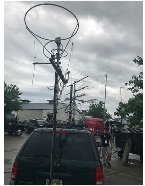
Lotsof mobile antennas at Dayton, in all shapes and sizes