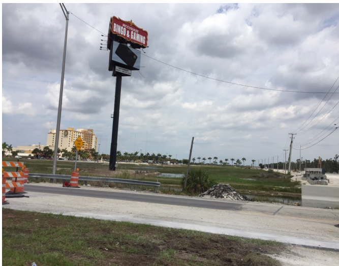
No stop here either—Bingo and Gaming