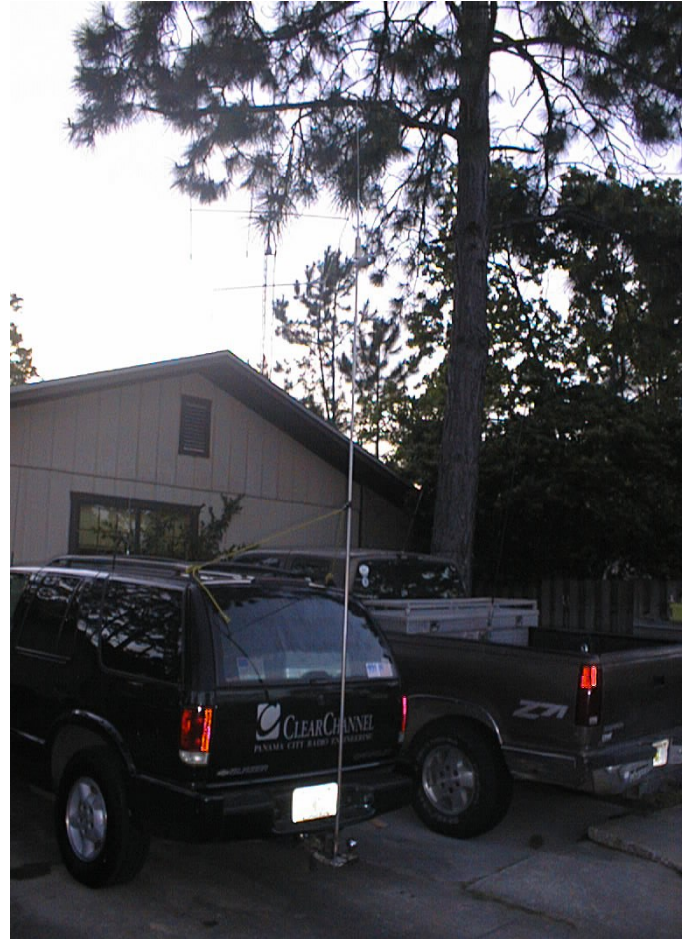
NF4A Mobile - Top Right: The 20/20 combo on the trailer hitch. Center Right: The 15 Meter Hamstick on the front bumper. Below: The operating position. The 706 was mounted on a special mount for police cars to hold their laptop...of course, there is the pack of Red Man, the official chewing tobacco of the FQP