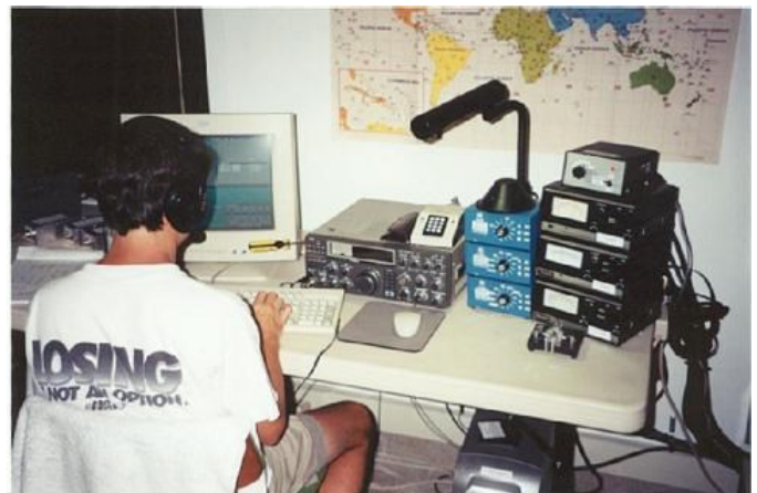
WC4E starts the contest on 20 Meters . Note Screw driver in the TS-930 to keep the radio on!