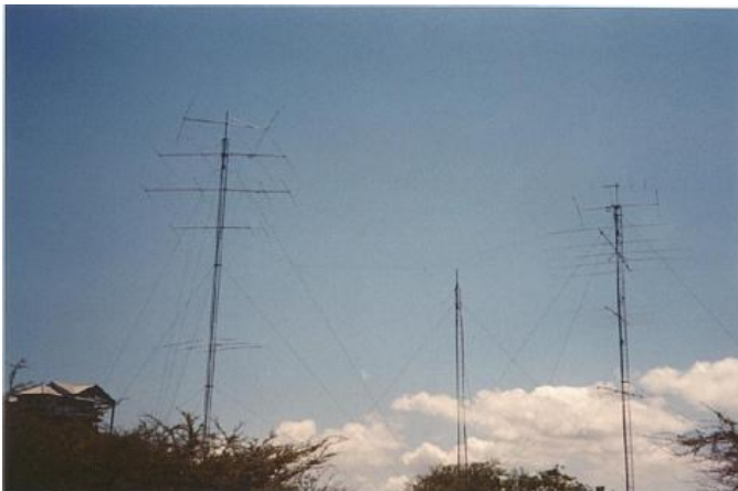
A good shot of the antennas of PJ2Z after a hard week of work. Left tower has 2el 40, 5el on 20, 15 and 10 Meters. A3 fixed to SE. The Right Tower has 5el 6M, Mosley CL33. 5 el 20 and 5/5 on 10M fixed to USA. The center tower will old a future 2el WARC antenna.