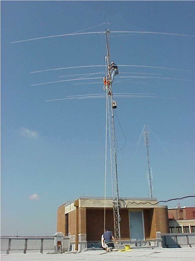
Jeff, WC4E (blue shirt) and Dan, K1TO (orange shirt) do some work on the Force 12 C4XL at the UCF Radio Club before the meeting.