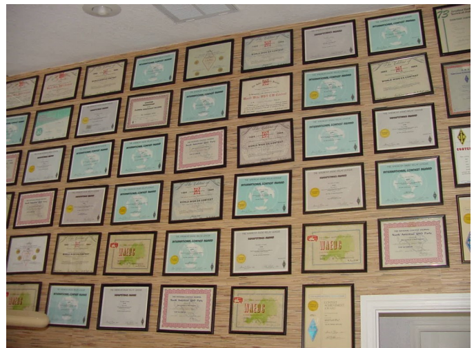
A small portion of the K4XS "certificate wall"

Additional pictures of some of the meeting attendees are shown on the next page