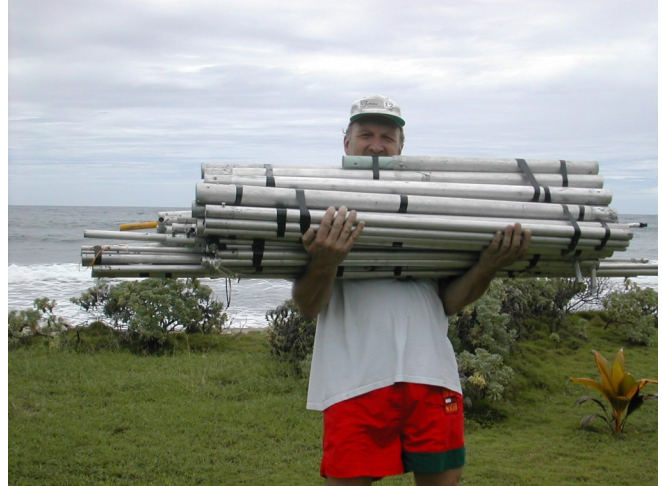
All the vertical antennas needed for the recent 6Y5A operation, in one neat bundle!