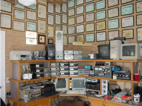
A portion of K4XS Main Operating Position