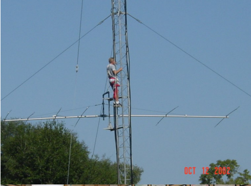
Part way up. (Bill was too small to picture when he reached the top!)