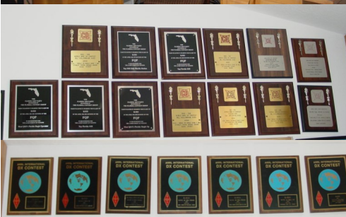
Part of the K4XS Plaque Collection