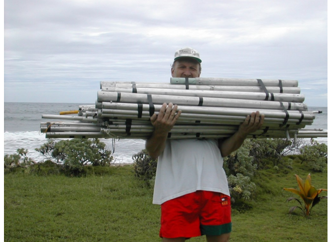
All the vertical antennas needed for the recent 6Y5A operation, in one neat bundle!