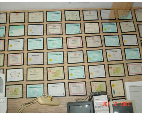
A (small) part of the K4XS certificate collection