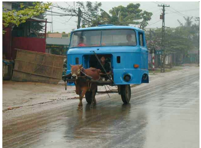
These guys show up for every FQP, send me a picture for the Gazette, but don't turn in their score! Considering their engine, it seems unlikely they covered many counties.