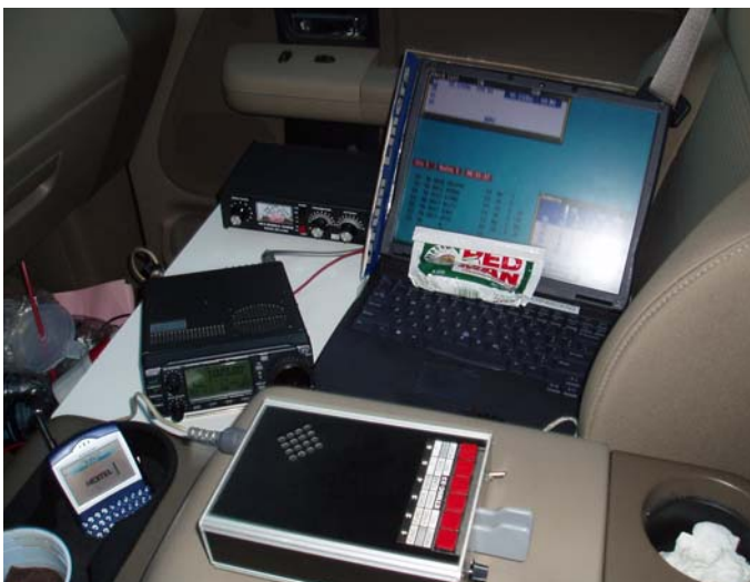
NF4A Operating Position, along with the required bag of Redman, the Official FQP Chewing Tobacco