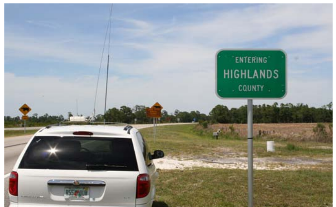
Below, N4KK/M enters Highlands County