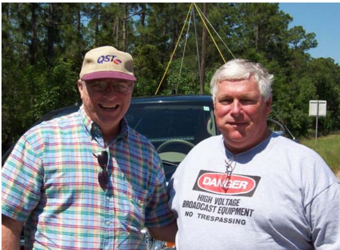
W5WMU/M and NF4A/M eyeball QSO in Gulf County