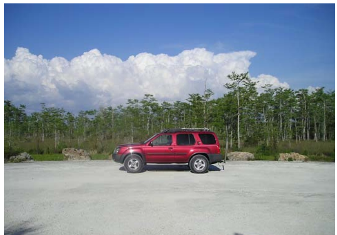
Another view of the K4OJ/M Nissan Xterra