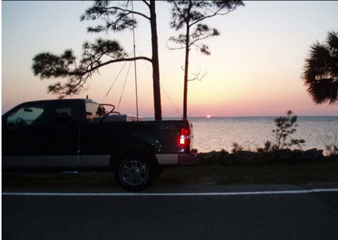
Sunset on St. Joe Bay in Gulf County with NF4A vehicle in Foreground