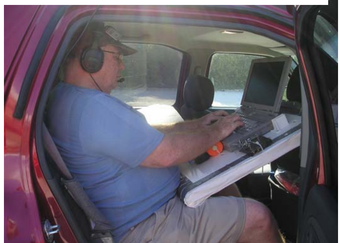
Red K0LUZ operating K4OJ/M